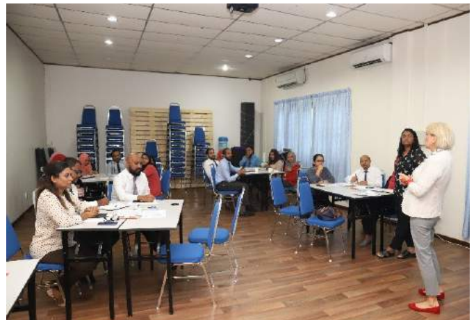
UNODC Training Session on Corruption Prevention