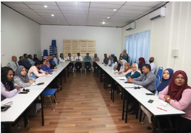
Stakeholder meeting regarding "Bandaara Kafa" march