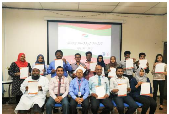
Anti-corruption training session conducted for the staff of Sports Corporation