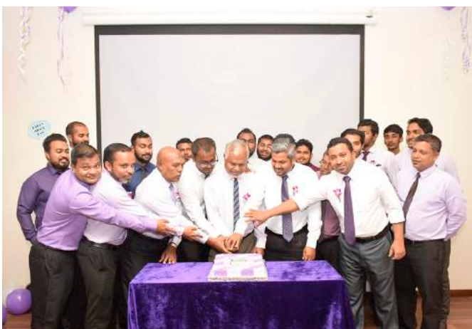
Special event held on the occasion of men's day 2019