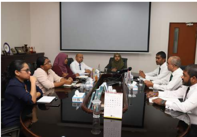
Members meeting with Ministry of Housing and Infrastructure