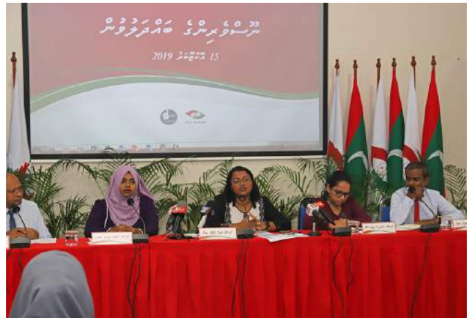
Press Briefing held to inform the public regarding work of the Commission